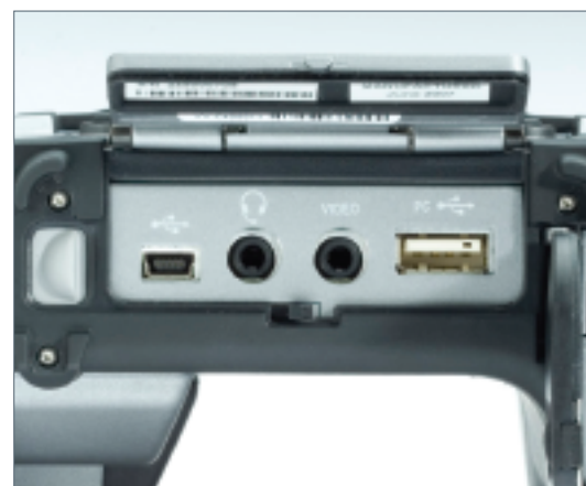
From Left to right: USB mini for PC image download, 4 pole audio for voice annotation, NTSC video, USB-A for memory stick image transfer